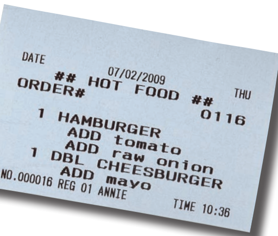
Kitchen requisition printed by the SPS-530 80mm receipt printer shown 75% actual size.